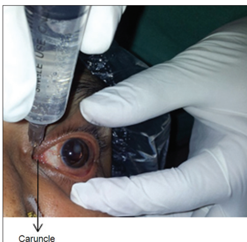
Figure 3: Needle entering between caruncle and medial canthal angle for performing medial peribulbar injection

While globe perforation refers to double puncture wounds (entry and exit wound), globe penetration has only a wound of entry. Patients with an axial length of >26 mm are prone to globe perforation. [13,28] Other risk factors include deep set eye, repeated